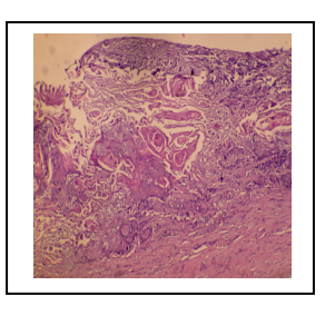
Fig. no. 3: Photomicrograph showing squamous cell carcinoma arising from the epithelial lining of cyst wall (H&E X10).