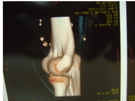
[ Plain X-ray: Photograph 3 ]

Imaging strategies in the evaluation of soft tissue haemangioma